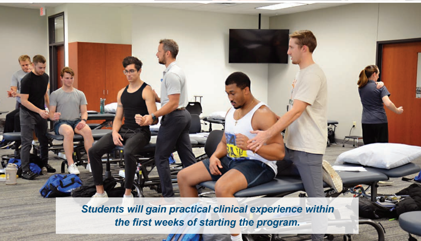
Students will gain practical clinical experience within the first weeks of starting the program.

The Doctor of Physical Therapy (DPT) is an entry-level, post-baccalaureate degree program that complements foundational movement sciences to prepare physical therapists for today’s healthcare challenges.