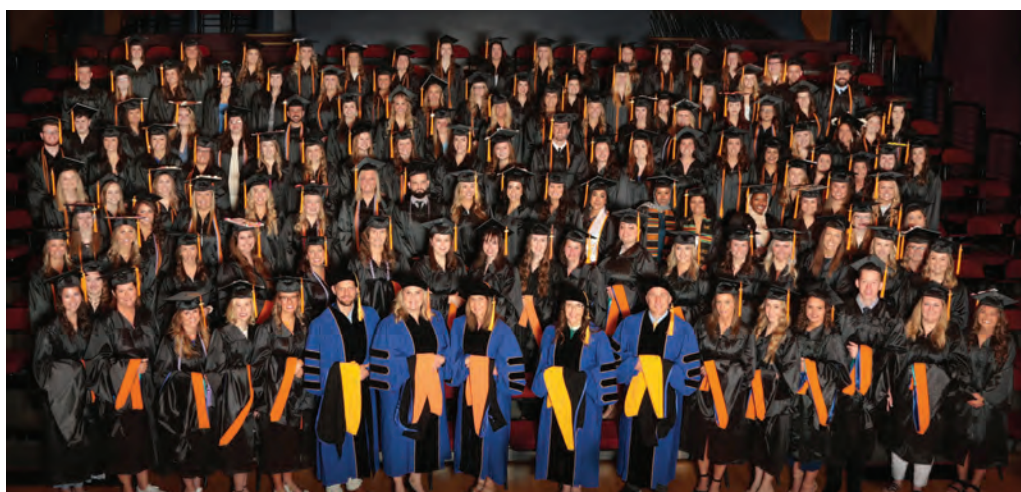
Class of May 2023