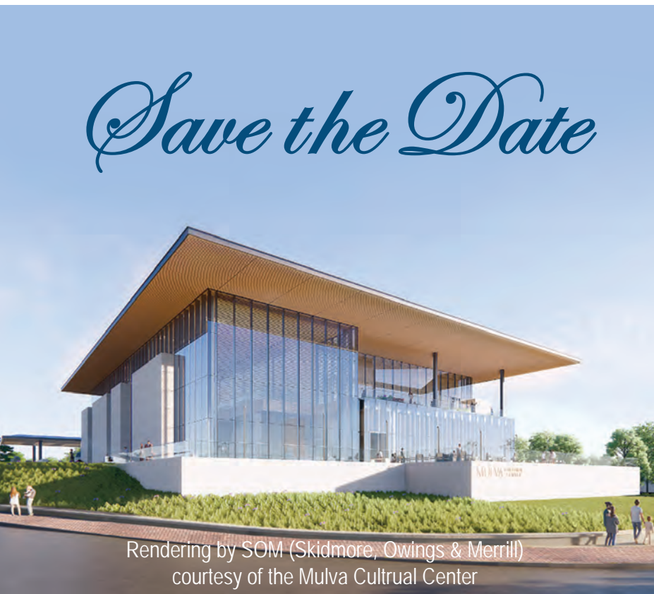
Rendering by SOM (Skidmore, Owings & Merrill)