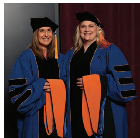
Doctor of Nursing Practice Inaugural Class of May 2023