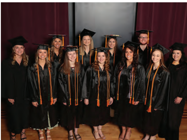
Bachelor of Science in Radiation Therapy Inaugural Class of May 2023