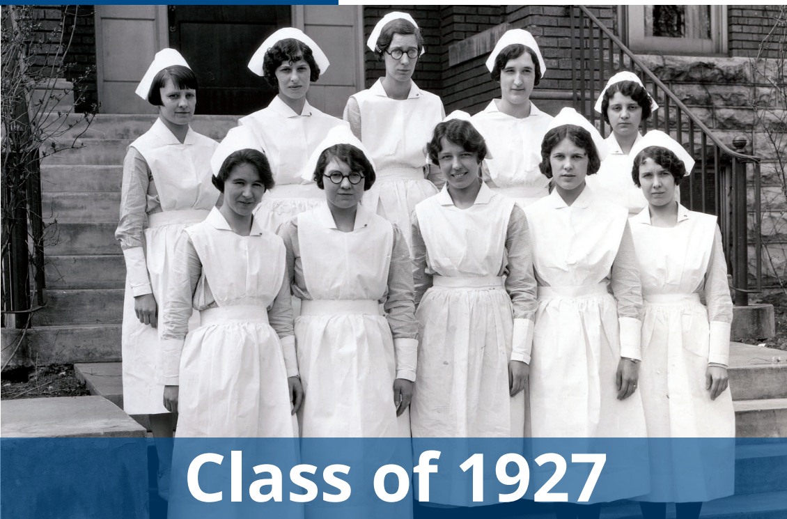
Class of 1927